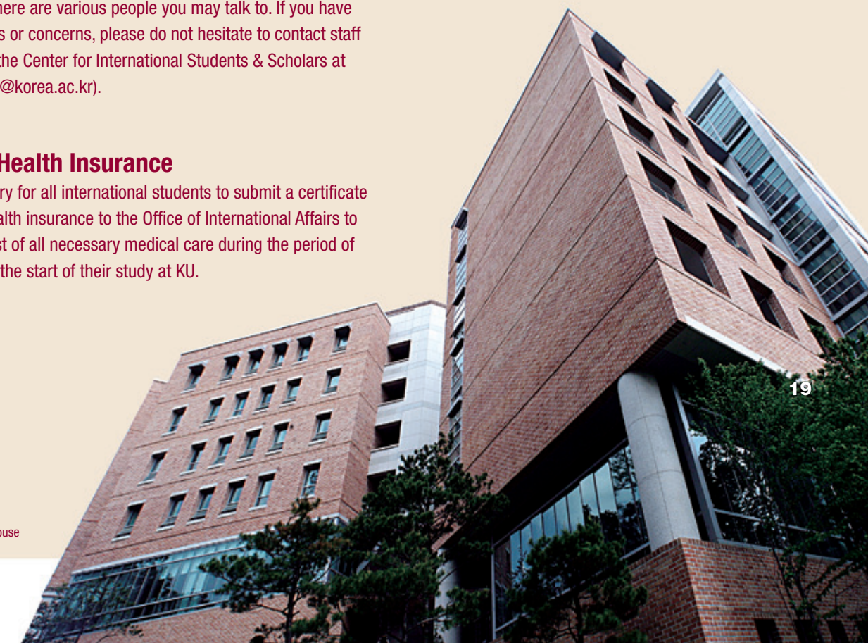
CJ International House

It is mandatory for all international students to submit a certificate of private health insurance to the Office of International Affairs to cover the cost of all necessary medical care during the period of study before the start of their study at KU.